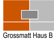
Grossmatt Haus B